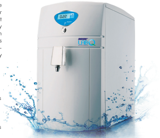
Capacity: 10 LPH